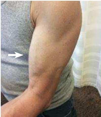
Figure 2a Normal long head of bicep. The muscle has a smooth arc from the shoulder to the elbow.