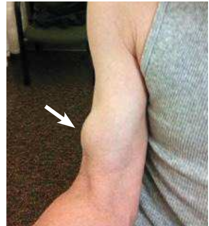
Figures 2b and Figure 2c Torn long head of bicep. The muscle has retracted toward the elbow.

groove of the humerus, the tendon mass is then inserted into the keyhole and pulled downward so that the tendon mass is locked in place.